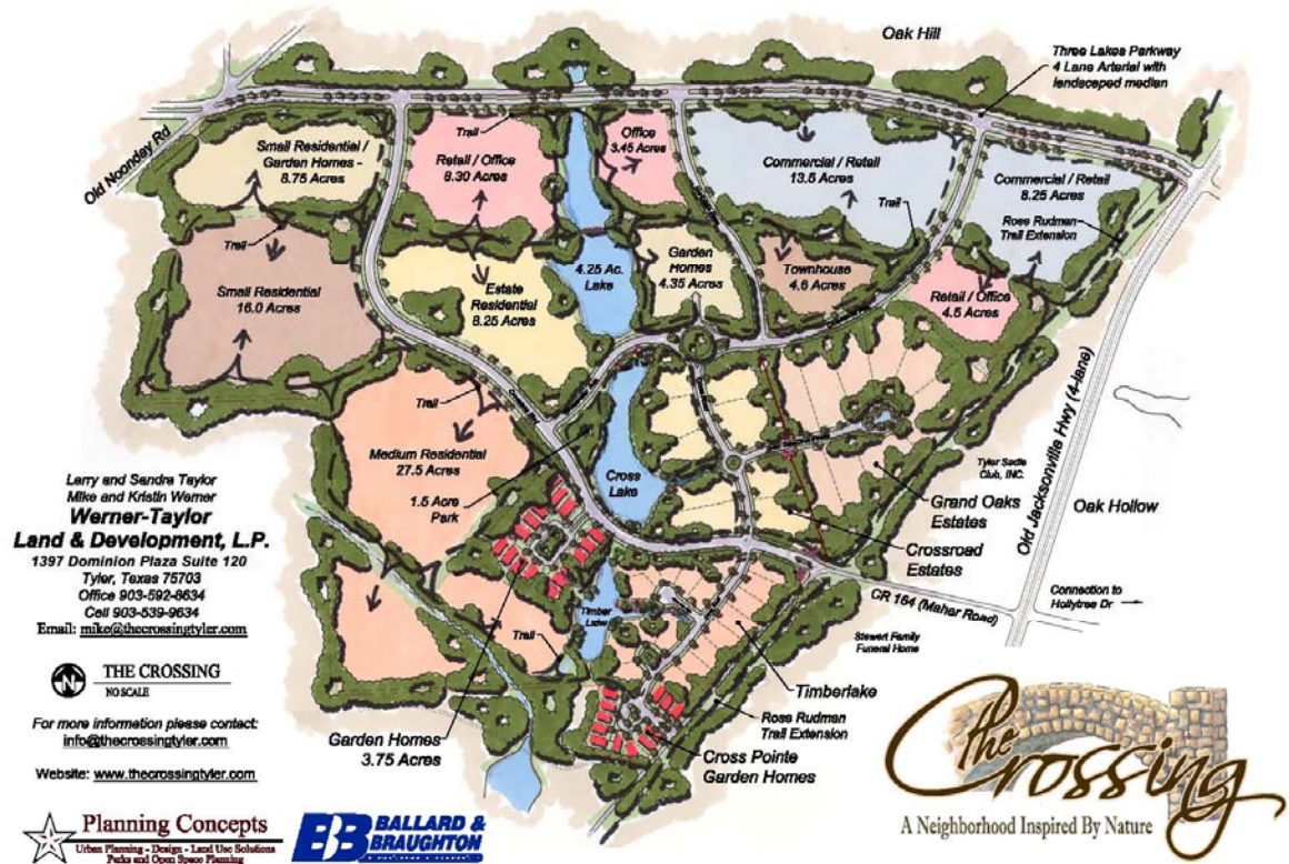
Figure 1 - Overall Master Plan

The Crossing is designed to optimize suburban needs by strategically intermingling small neighborhood retail centers with regional retailers and entertainment uses along Three Lakes Parkway with the residential developments within the interior of the property. Office uses are to be generally concentrated near the retail centers and alongside water features which will be seen throughout the development. The goal of this development is to successfully integrate a variety of land uses and densities to accommodate all the needs of the patrons and homeowners.