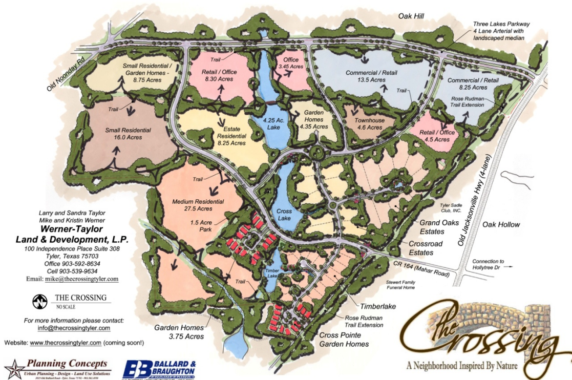
Figure 1 - Overall Master Plan

is to successfully integrate a variety of land uses and densities to accommodate all the needs of the patrons and homeowners.