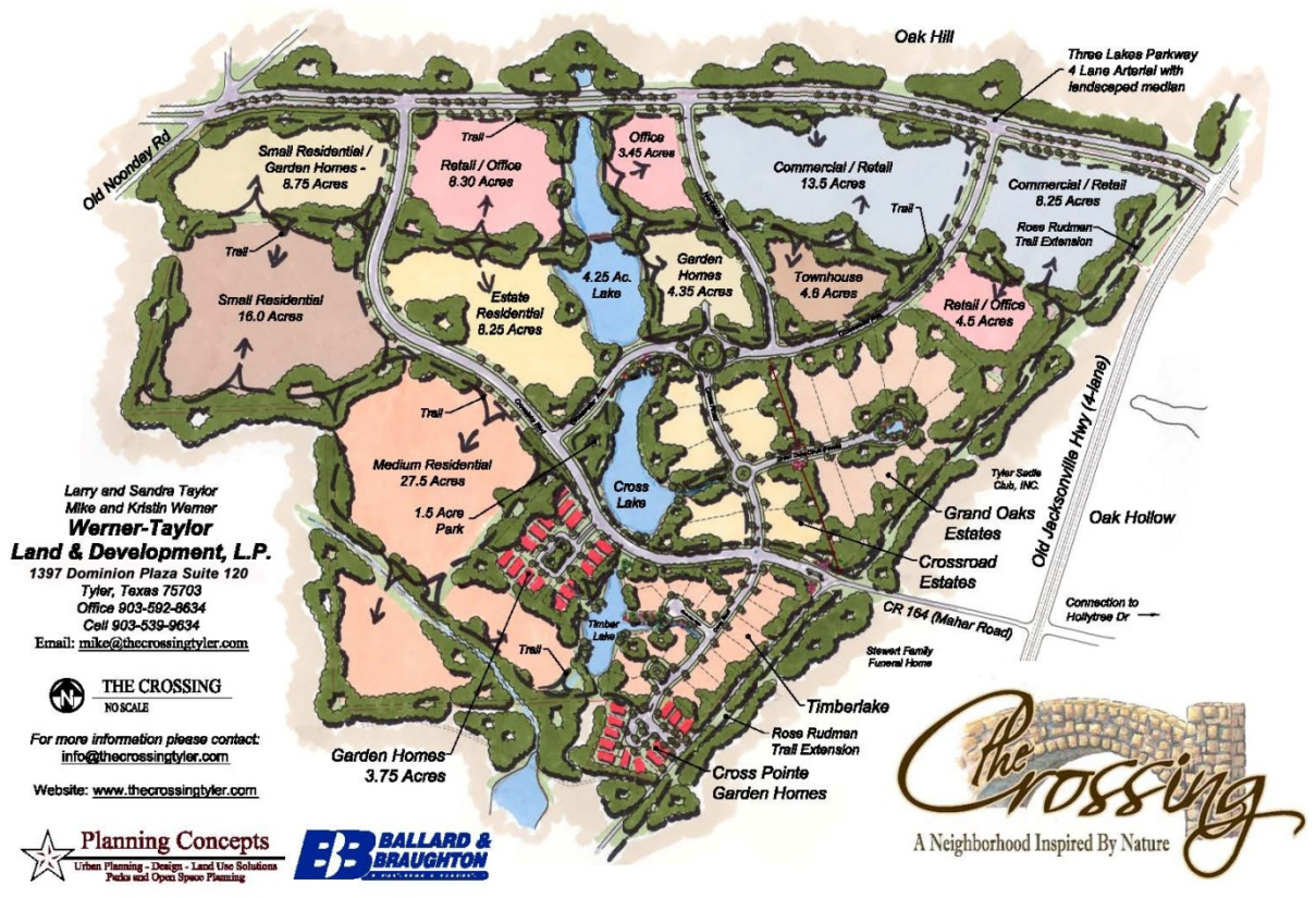
Figure 1 - Overall Master Plan