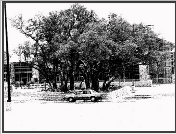
Fig. 1 – Typ. Tree Preservation