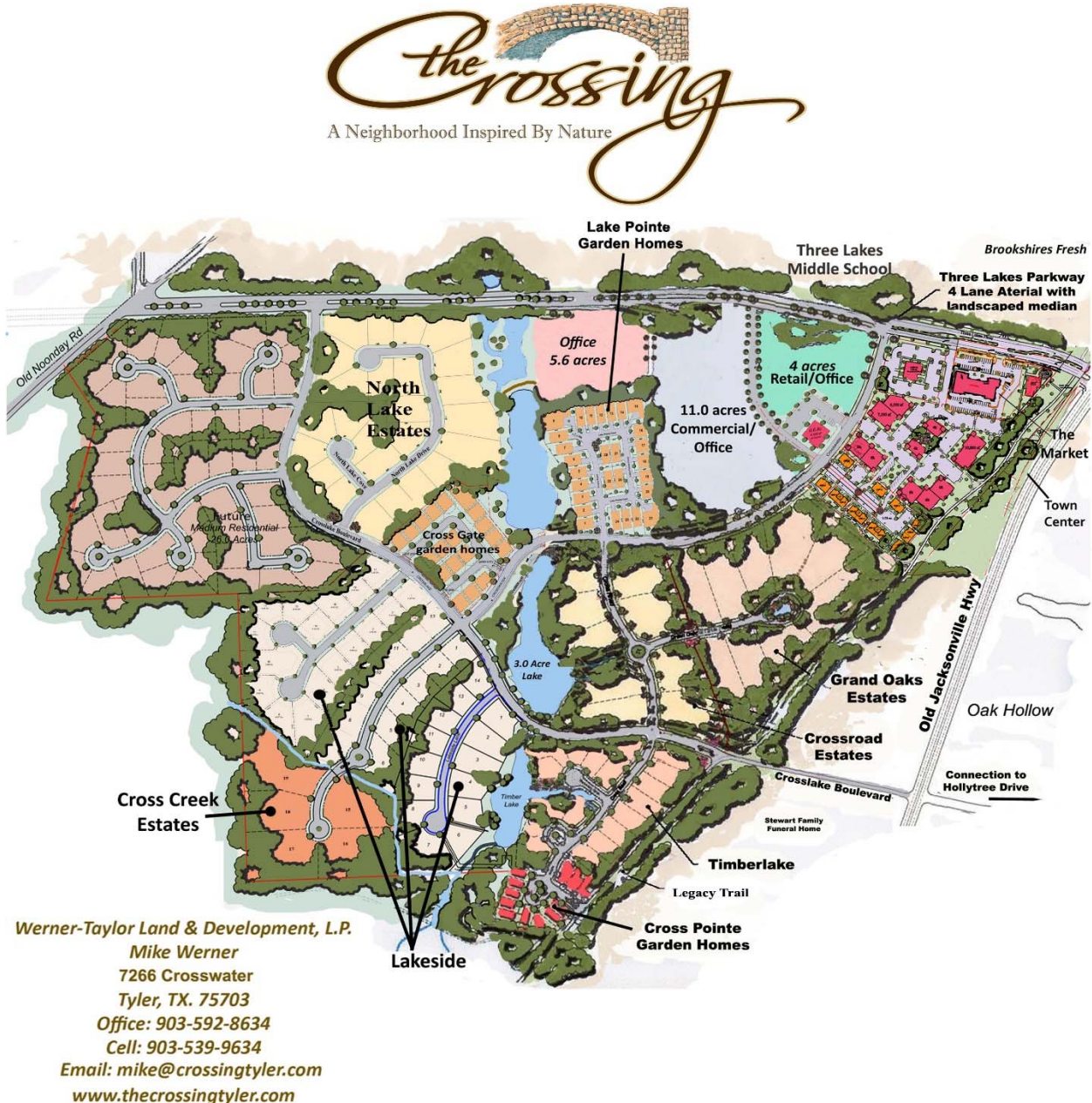
Figure 1 - Overall Master Plan

The Crossing is designed to optimize suburban needs by strategically intermingling small neighborhood retail centers with regional retailers and entertainment uses along Three Lakes Parkway with the residential developments within the interior of the property. Office uses are to be generally concentrated near the retail centers and alongside water features which will be seen throughout the development. The goal of this development is to successfully integrate a variety of land uses and densities to accommodate all the needs of the patrons and homeowners.