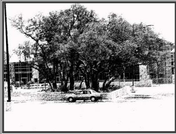
Fig. 1 – Typ. Tree Preservation