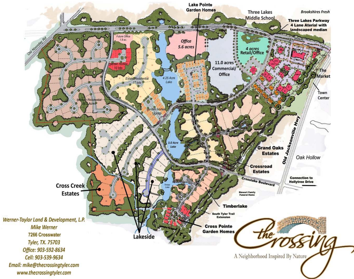
Figure 1 - Overall Master Plan

Lakes Parkway with the residential developments within the interior of the property. Office uses are to be generally concentrated near the retail centers and alongside water features which will be seen throughout the development. The goal of this development is to successfully integrate a variety of land uses and densities to accommodate all the needs of the patrons and homeowners.