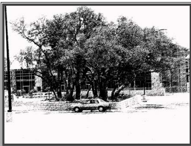
Fig. 1 – Typ. Tree Preservation